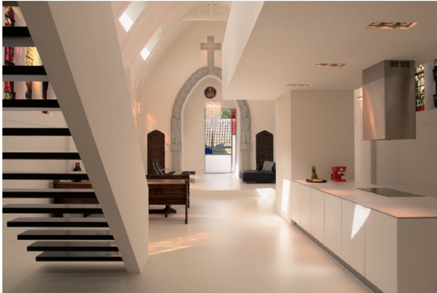
above The extensive use of white accentuates the spaciousness, while creating a heavenly environment opposite page The minimal staircase leading to the study seems to float in the air, reinforcing the impression of airiness conveyed by the overall design

Now turned into a study, the balcony at the front of the organ was maintained and used as a dividing feature between the various living spaces. Tins explains: "When you enter the chapel you stand in a hall, which prepares you to enter the living room. Then you open the two doors and you look at the kitchen, which is located under that spatial element. After that, you notice the large space, the height, the beautiful white interior, and the coloured windows. The study is on the dividing element in front of the old organ. The stair including that study is the element that turns the chapel into a living space."