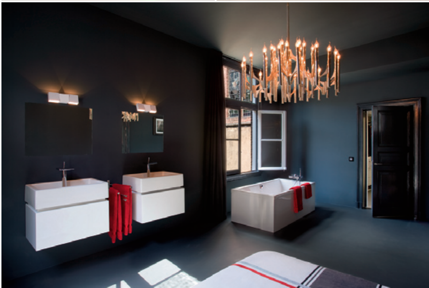
opposite page from top left Furniture of assorted styles and eras contribute to creating a dynamic, stimulating interior • Located on the balcony, the study is characterised by its wooden floor parts and by the homely mood it conveys • The bedroom/bathroom distinguishes itself by its dark tones and its solemn ambience