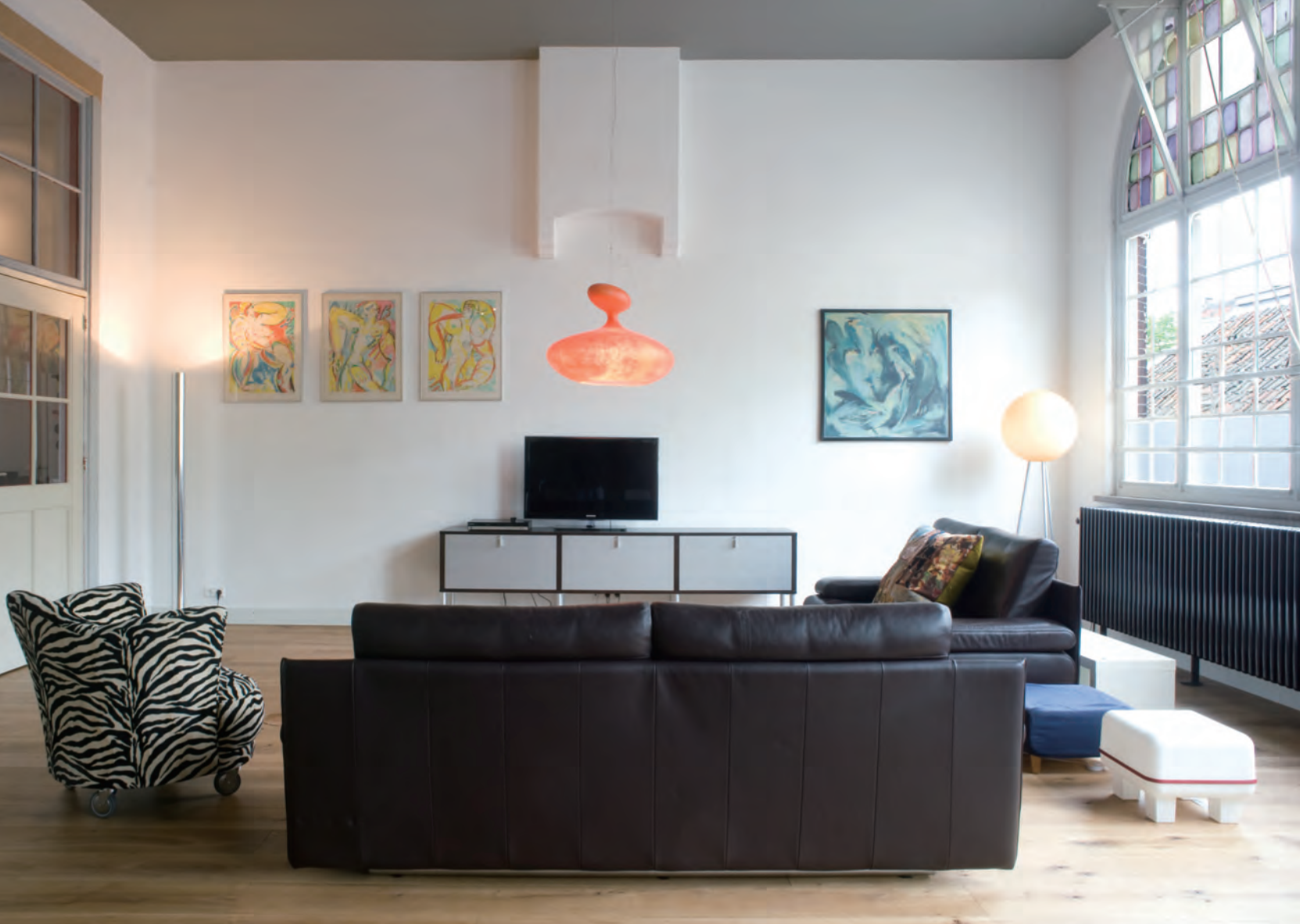
Office & living room of master

In an old school building on the 'Oude Gracht' in Utrecht was once on the ground floor a gym, dressing rooms and a staffroom. The rest of the school building was developed by a developer, but the gym, dressing room and staff room were sold as a separate item. Because of the newly developed upper apartments and their new roof terraces skylights were closed in the gym ceiling. To get more daylight back into the house a patio was added to increase the living quality.