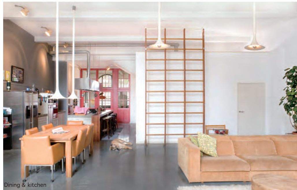
Dining & kitchen